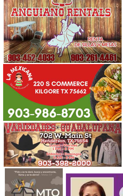
Plate Lunches &